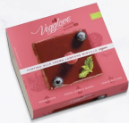
RASPBERRY & BLUEBERRY 110G