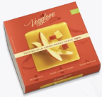
MANGO & PEACH 110G

Organic desserts made with selected ingredients: gluten-free, milk and no derivatives, without eggs, palm oil and preservatives.