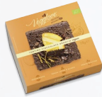
ORANGE CHOCOLATE CAKE 110G