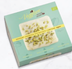
PISTACHIO & RASPBERRY 110G